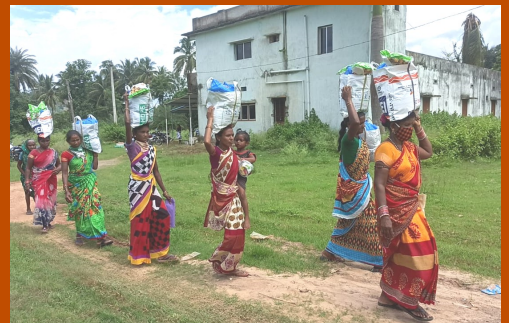
SUPPORTED FOR LIVELIHOOD

As a kind of emergency COVID-19 response, The Rural Educational Activities for Development (READ) had reached out to 2500 most vulnerable families and supported with sanitary kit containing face mask, detergent soap and liquid floor sanitizer where about 12500 people were being benefited directly out of the supports. Apart from these the people were being made aware through demonstration programme at distribution centres on use of sanitary kit, maintaining social distance and regular hand washing while they are at home as well as at work places.