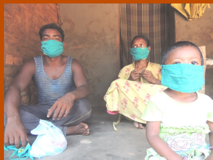
SUPPORTED WITH SANITARY KIT

Early in March 2020, the spread of COVID-19 1st wave has been realised all over the world where prevention mechanism was prioritize through international and national news channels, social media and government circulation. In order to sensitize the community READ has also been undertaken action and made aware about 170 villages of Rayagada, Gajapati and Ganajm district through audio awareness campaign for which about 11052 household over 55250 population reach out and sensitised for wearing mask, social distancing, regular hand washing and medical