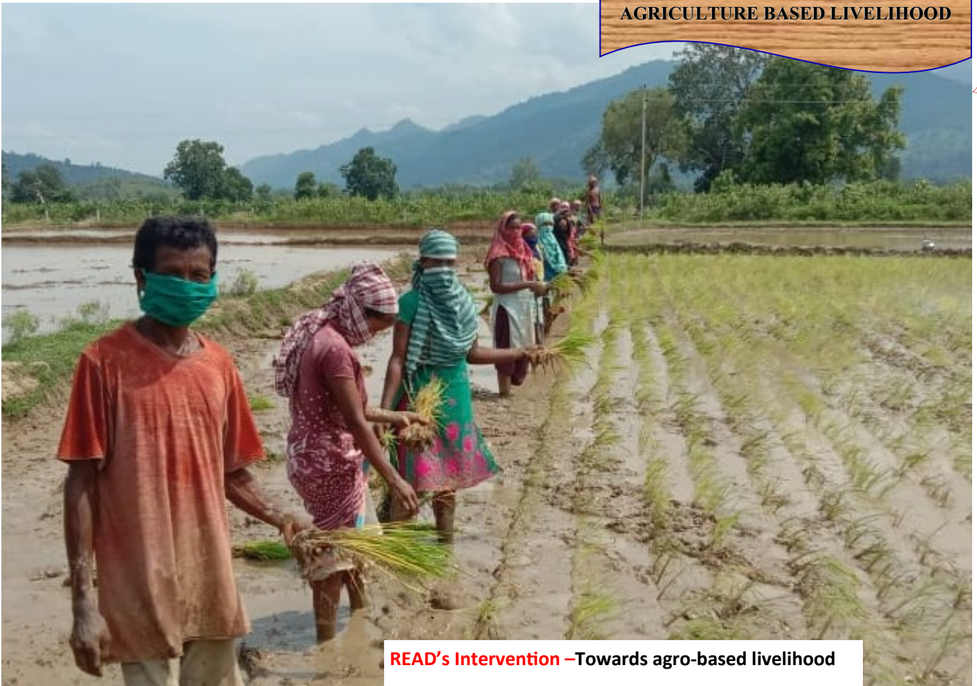
READ's Intervention –Towards agro-based livelihood

Livelihood is a backbone of society and agro-based livelihood is an important and essential occupation of rural India where about 85% of total household adopts agro-based livelihood towards food security and income generation. Realising the practical context the Rural Educational Activities for Development (READ) has been facilitating agro-based livelihood programme in 170 villages of Rayagada, Gajapati and Ganjam districts of Odisha since 20011. The prime motto of the intervention is to improve sustainable social and economic development optimizing the available resources. The programme has been facilitating through Self Help Group, House mother (Widows) Self Help Group, Farmers Committee and engagement of Livelihood Resource Persons (LRP).