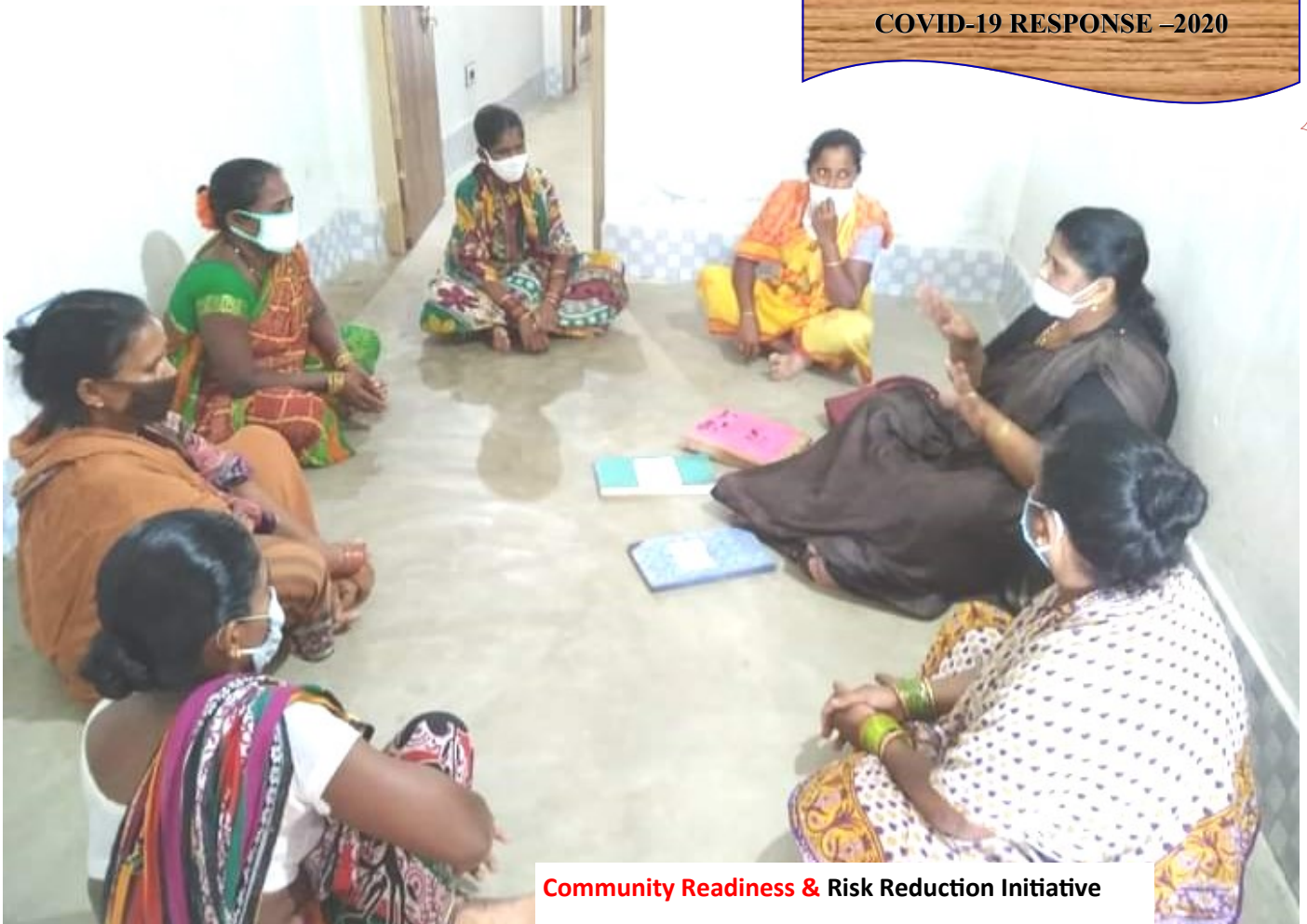
Community Readiness & Risk Reduction Initiative

The current outbreak of coronavirus disease (COVID-19) first reported in Wuhan, China, on 31 December 2019, has expanded rapidly across the globe. As of 31 March 2020, there are globally, a total of 824,529 reported cases and 40,672 deaths from the COVID-19 pandemic. The World Health Organization has declared coronavirus disease (COVID-19) a global pandemic. As of 18 March, India reported its third death, while the total confirmed and reported cases have risen to 152. State authorities across India are now ordering the same kind of restrictions as in the worst-hit nations. Schools are shutting. So are swimming pools, gyms, athletic arenas, malls and movie theatres. Weddings and other public gatherings are being banned although it is not clear how strictly people are adhering to these bans.