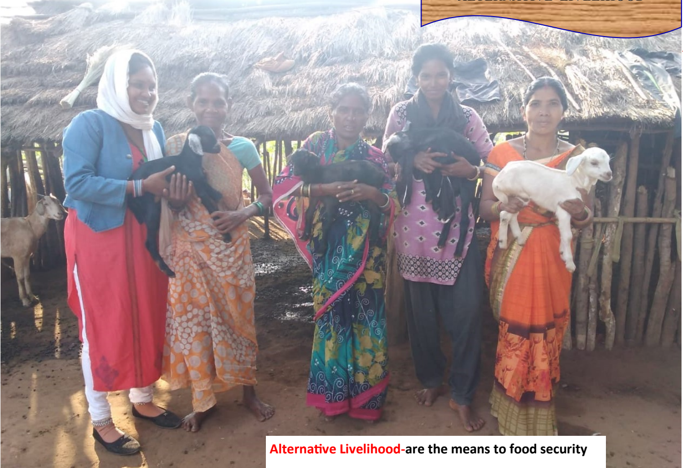
Alternative Livelihood -are the means to food security

Alternative livelihood initiative has been facilitated by READ since its inception because the marginal farmers and agriculture labourer, women group and widow group are not able to increase their income also unable to access food at least thrice in a day around the year. The alternative livelihood could pave a space towards additional income of the family which add value to the annual income of the household, hence READ supported the community especially the farmers committee (FC), women Self Help Group (SHG, Widow Self Help Group (SHG) and Livelihood Resource Persons (LRP) through training, workshop, seeds support, financial supports so as to earn additional income of the family towards food security.