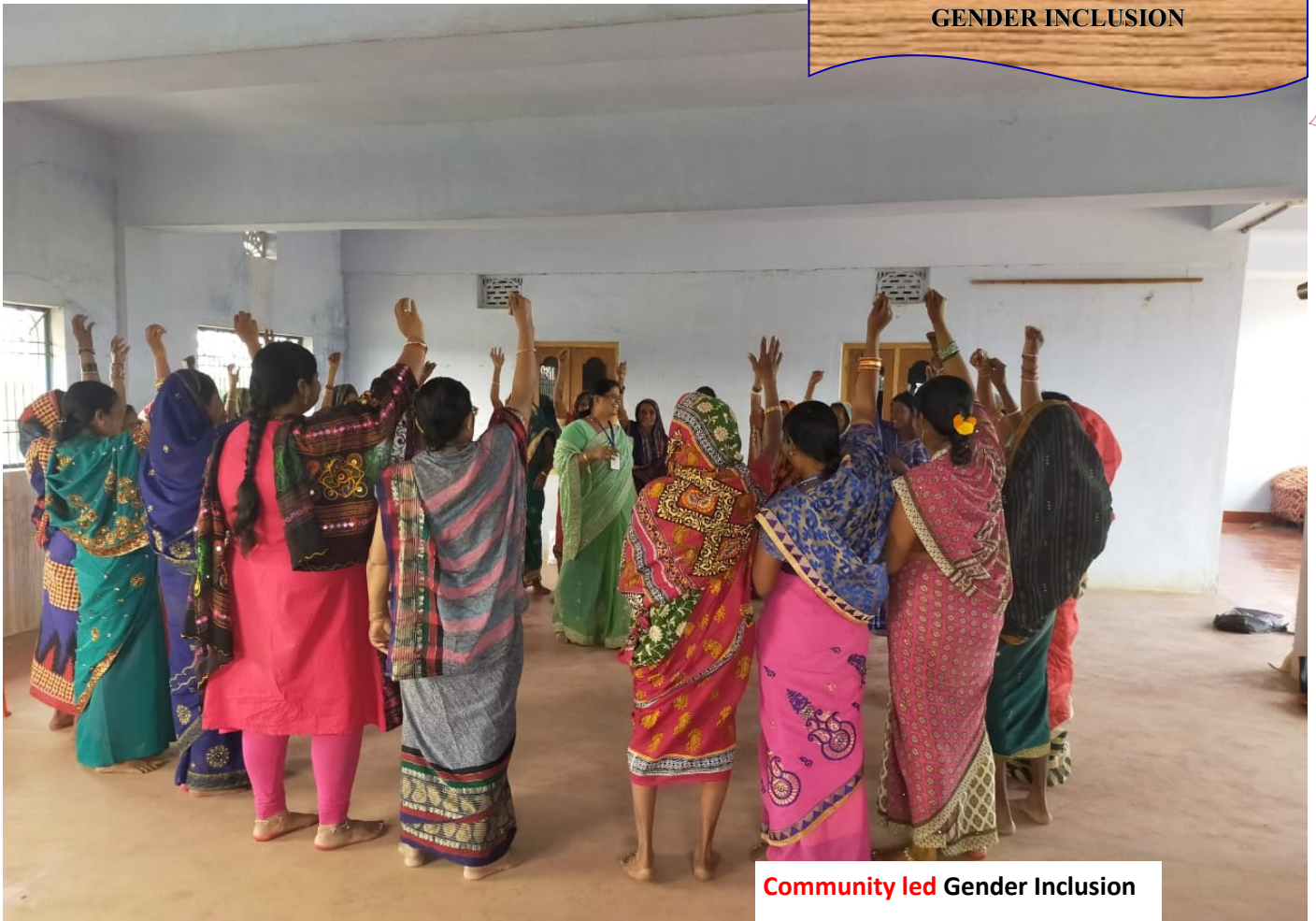
Community led Gender Inclusion

Violence against women and girls is a fundamental violation of human rights, which stretches across nations, cultures, and classes. It is a mass phenomenon taking many different forms with disastrous consequences for women's and girls' health and survival. The social and economic costs resulting from this abuse place substantial burden on society as a whole, significantly hampering development.