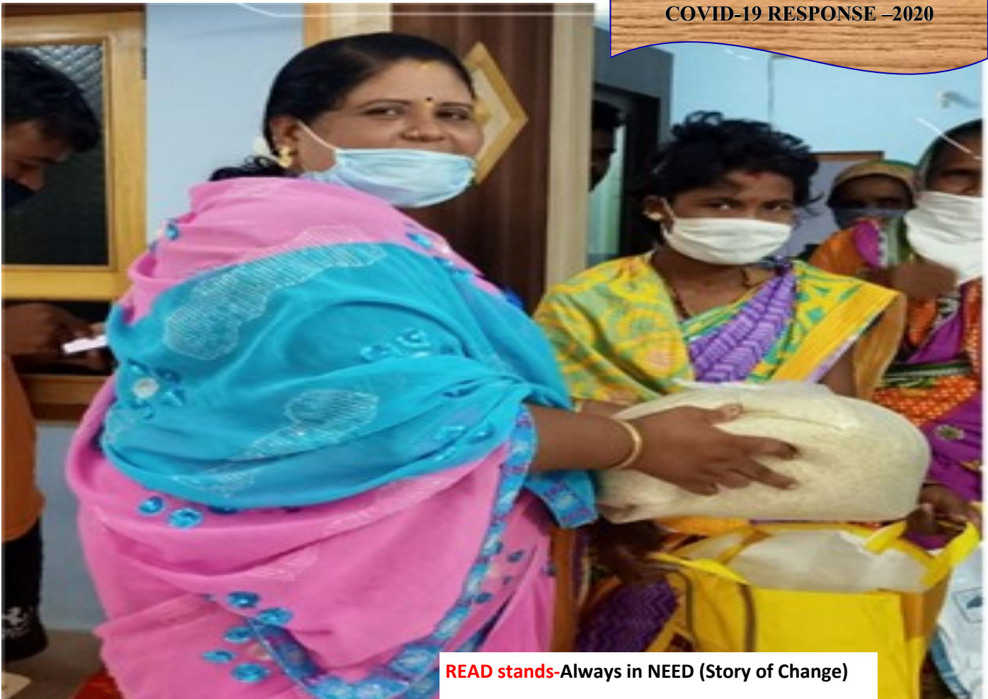
READ stands-Always in NEED (Story of Change)

"There is a sacred grace, who always ready to pull back when you fall down"