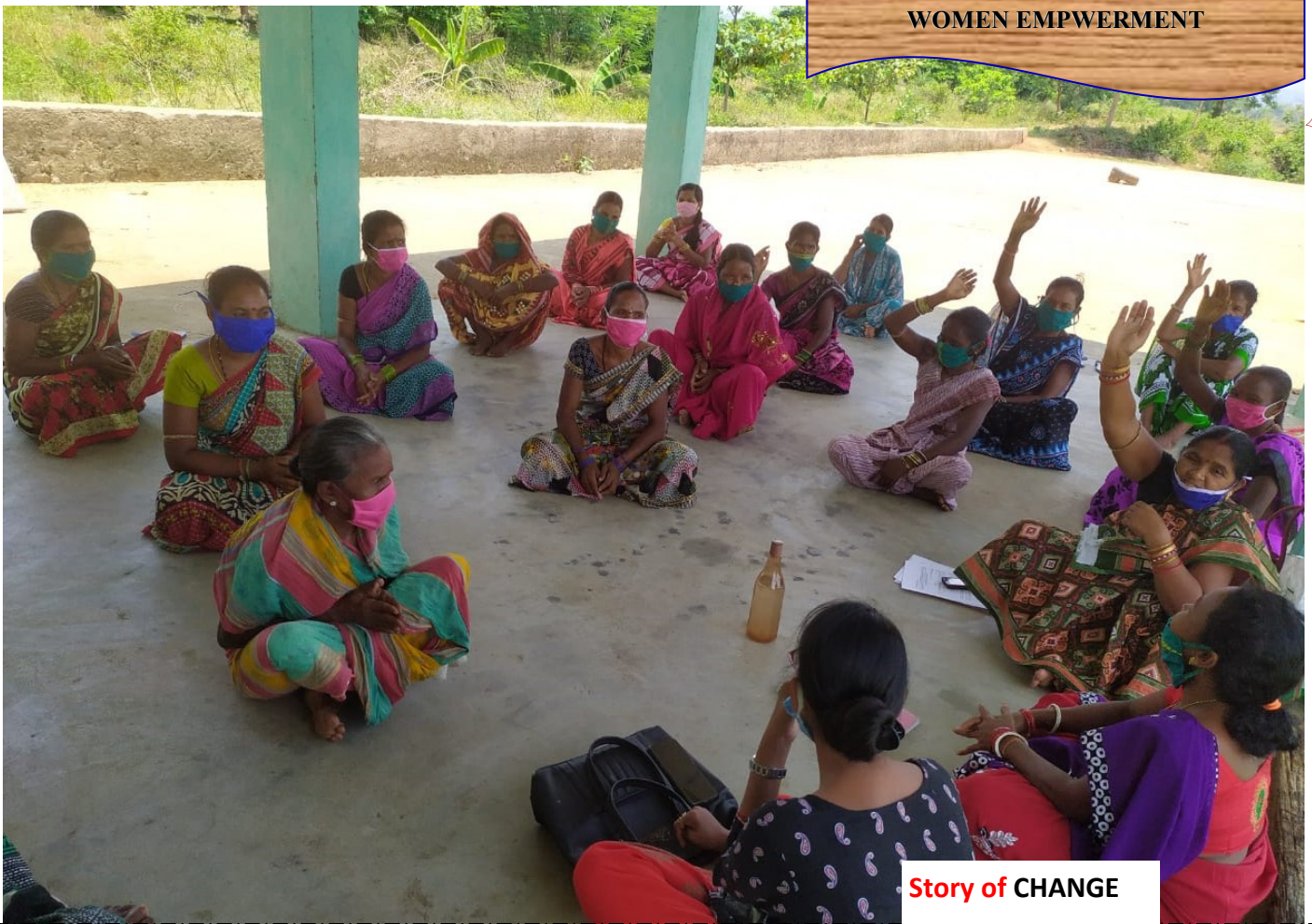
Story of CHANGE

RASHMI ATMA SELF HELP GROUP (SHG) one of the exemplary Widow group from Mayapatana village under Sriramchandrapur Grampanchayat of Chatrapur Block in Ganjam District of Odisha was promoted and strengthened by READ, Berahampur in the year 2011. The group has 12 members who have been improved skilled by attending various income generation training and exposure organised by READ and also accessed skilled training facilitated by MISSION SHAKTI, ODISHA.