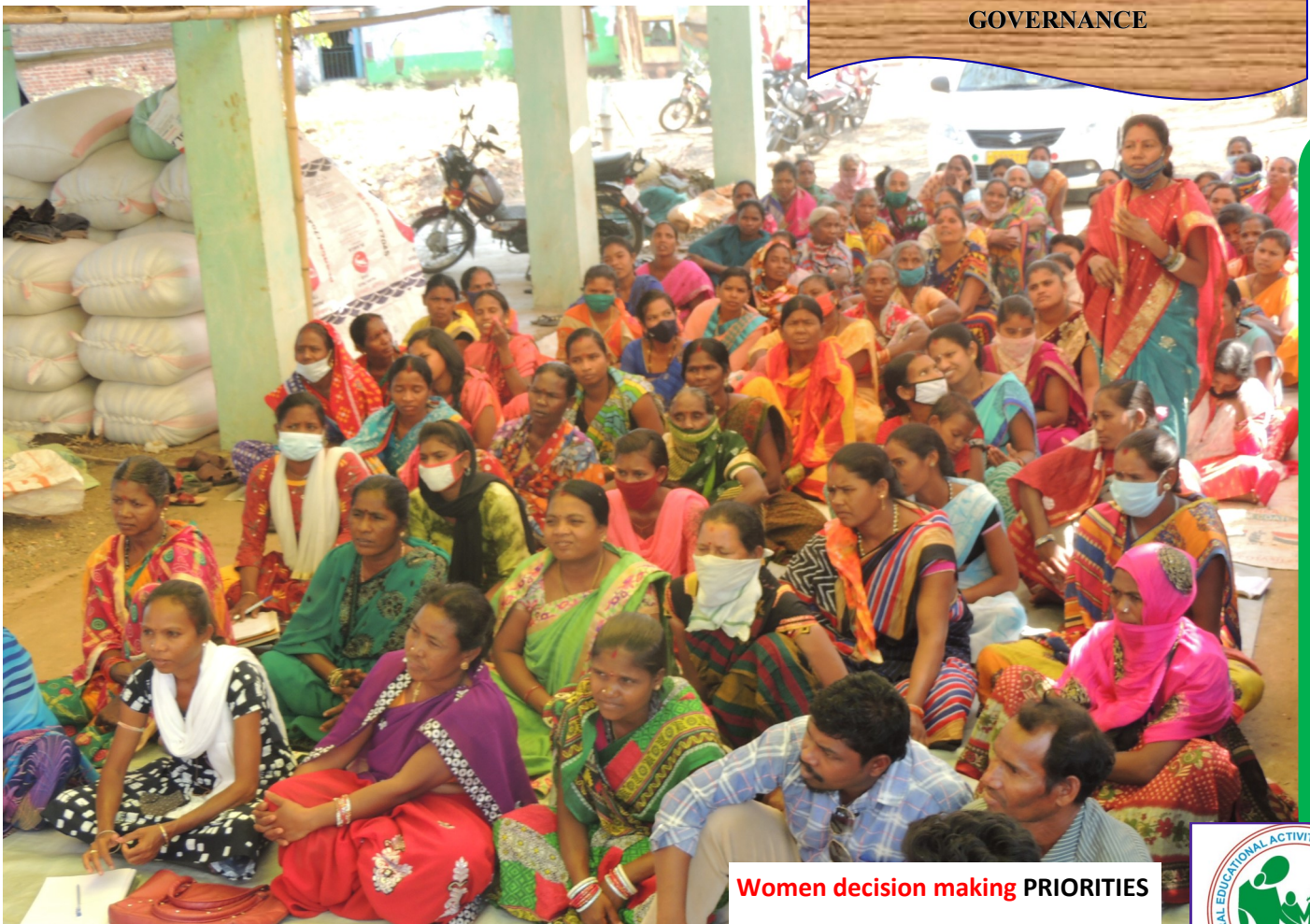
Women decision making PRIORITIES