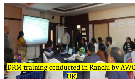
DRM training conducted in Ranchi by AWC,

A five day rigorous training on Disaster Risk Management was organized by AWC in Ranchi for READ and Srijan Foundation in January 2019 which participated by all the office staff. READ's field area being prone to natural disasters like cyclone and flood