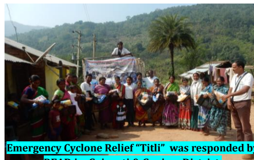
Emergency Cyclone Relief “Titli” was responded by READ in Gajapati & Ganjam District.

The Cyclone “Titli” was hit in Odisha especially in Gajapati, Rayagada & Ganjam District of Odisha, where about 31 Blocks 4900 villages affected, 21 human casualties 28073 livestock casualties, 45893 houses damaged 153532 hectors crops affected. In READ operational area 3 Blocks 13 GPs 51 villages 7296 families were affected out of which 1159 families were provided support by READ in Mohana Block of Gajapati District with tarpaulin, rope, blanket, mosquito net, LED solar light, sanitary napkin and mat. The concern BDO of Mohana Block had cooperated and supported READ in this process enormously.